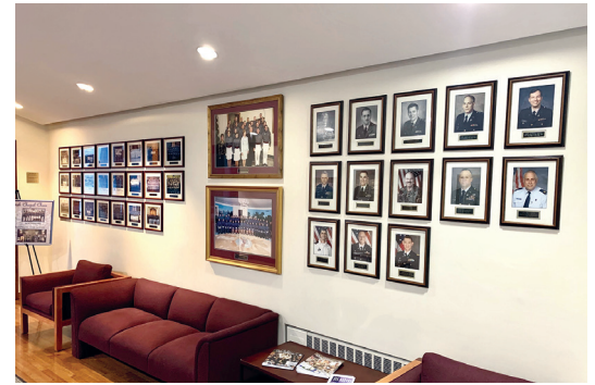
Above, pictures of the Jewish Chapel's Choir and Chaplains hang in new frames above reupholstered furniture in the gallery off of the Social Hall. Below, a new dehumidifier protects hundreds of books in the Chapel library from mold and other moisture-related damage.

Reupholstering Furniture. After more than 25 years in the Chapel, a number of leather benches and upholstered chairs and sofa were in need of repair. The WPJCF funded the replacement of the leather on the benches and reupholstered the furniture so that it gives the Chapel a fresh appearance.