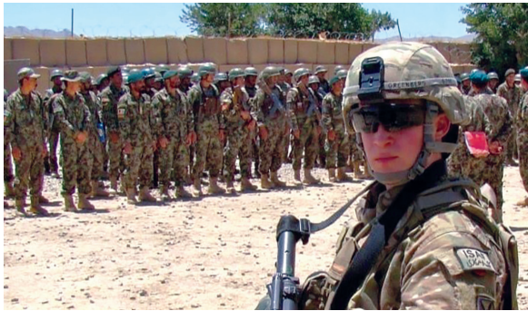
"Toto, I have a feeling we're not at Northwestern anymore."

I was born in New York City and we moved to Larchmont, NY, just before I turned four. After graduating Northwestern, working at the International Institute for Counter Terrorism in Israel, and completing my MA in Terrorism, Security & Society at King's College London in the United Kingdom, I joined the Army