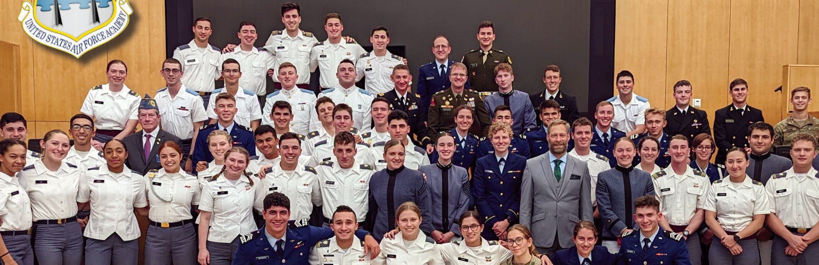
Wild 'White Over Gray' Yonder: West Point's delegation of 35 Cadets exceeds the number of JWW participants from Air Force, Navy, and Coast Guard combined. It's still the Army Air Corps as far as we're concerned! Below: The Budoff family provides a warm welcome to chilly Colorado with gift bags of treats for the Cadets.