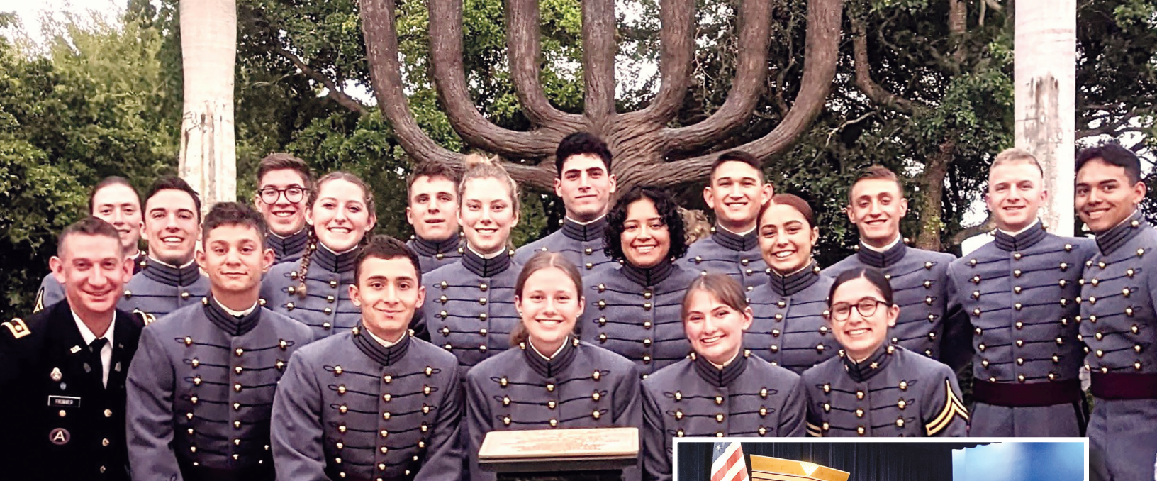
Florida Everglades: Far from its natural habitat, the Jewish Chapel Choir redefines casual Florida attire during its visit to Boca Raton.