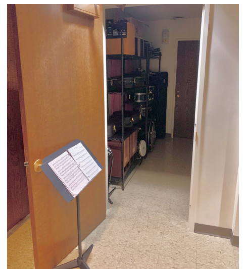
The addition of a door for the Music Alcove now allows the instruments purchased by the WPJCF to be organized and stored securely. Musical accompaniment by the Jewish Chapel Cadet Band has directly contributed to increased community attendance at Shabbat services and holiday celebrations.