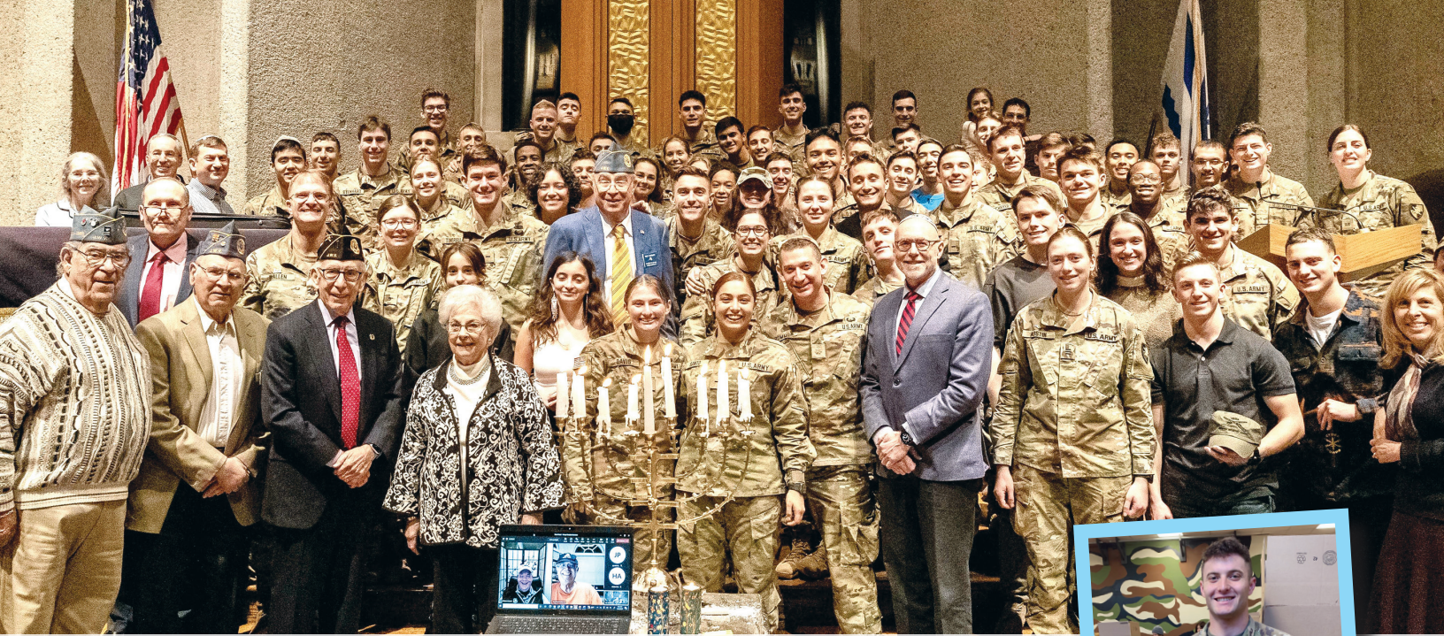
Maccabean Might: The Jewish community gathers in force to celebrate the triumphs of ancient Judean warriors and the new generation of Jewish military leaders that carry on their legacy.