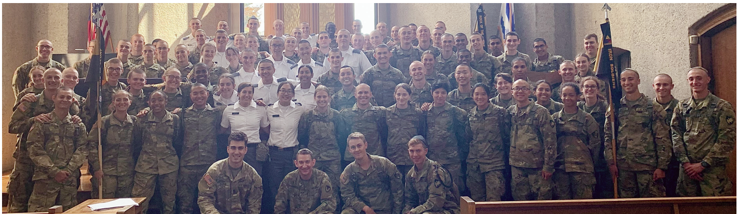
Broken Algorithm: Jewish Cadets, New Cadets, and friends rewrite the record books for summer attendance at the Jewish Chapel, and cause rolling bagel blackouts throughout Rockland County in the process.